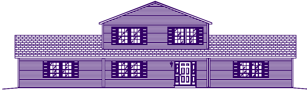
FRONT ELEVATION OVERALL DIMENSIONS: 72'-0" x 33'-0" (with garage)