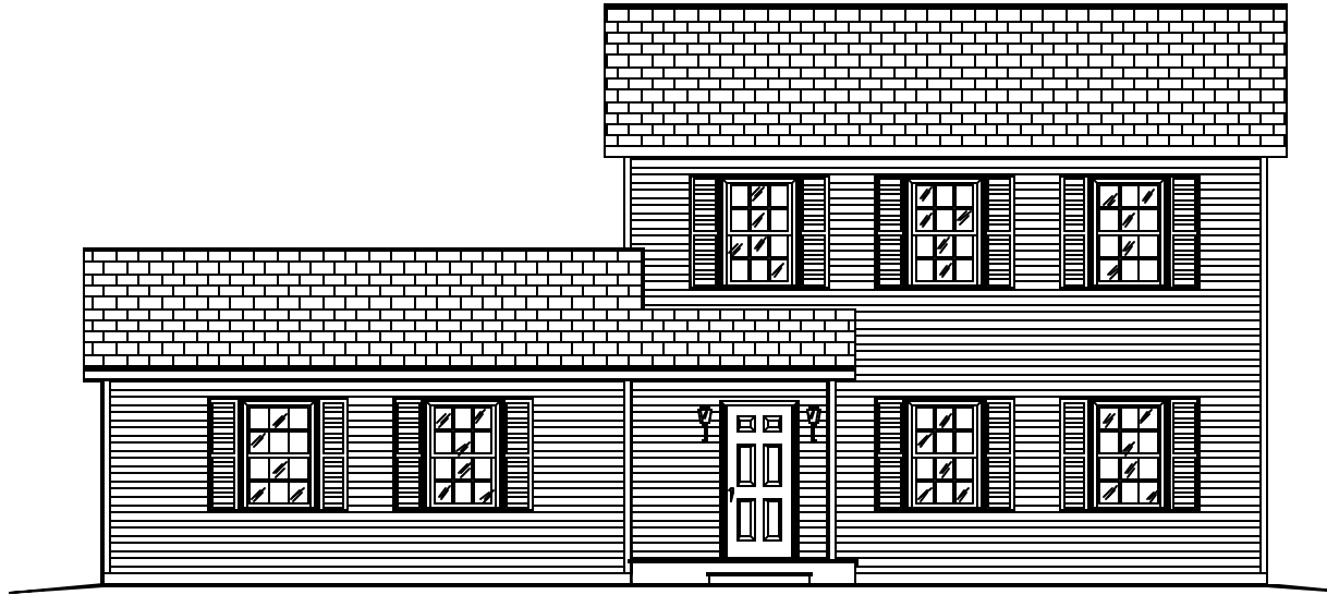
FRONT ELEVATION OVERALL DIMENSIONS: 28'-0" x 28'-0" (without garage)