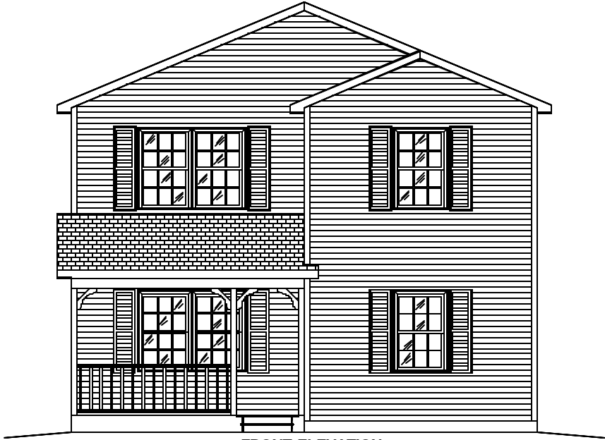
FRONT ELEVATION OVERALL DIMENSIONS: 28'-0" x 32'-0"