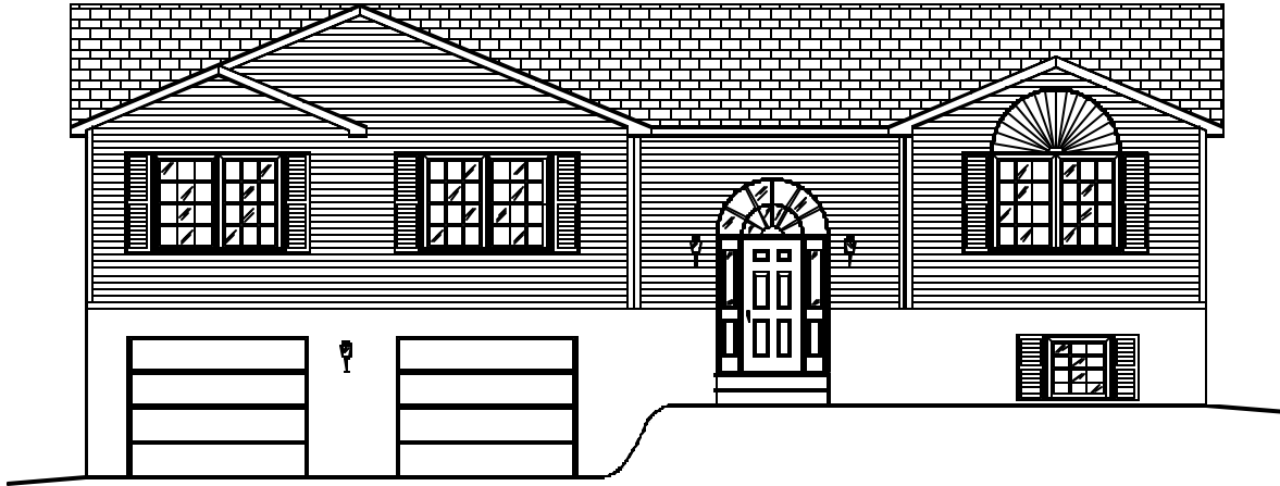
FRONT ELEVATION OVERALL DIMENSIONS: 56'-0" x 28'-0"