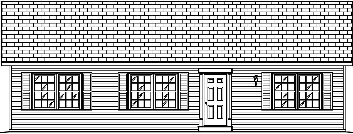
FRONT ELEVATION OVERALL DIMENSIONS: 44'-0" x 24'-0"