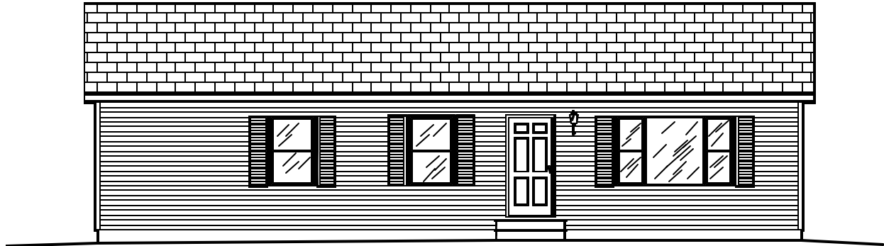
FRONT ELEVATION OVERALL DIMENSIONS: 48'-0" x 28'-0"