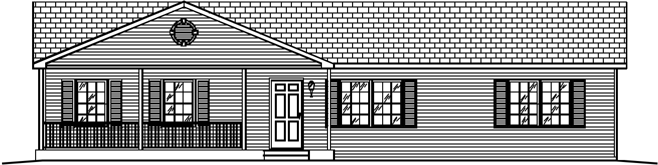
FRONT ELEVATION OVERALL DIMENSIONS: 56'-0" x 28'-0"