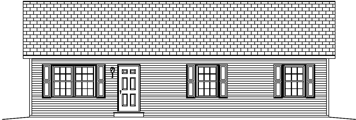
FRONT ELEVATION OVERALL DIMENSIONS: 44'-0" x 24'-0"