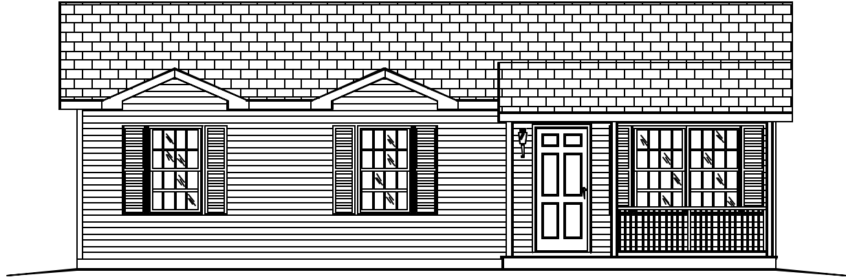
FRONT ELEVATION OVERALL DIMENSIONS: 40'-0" x 24'-0"