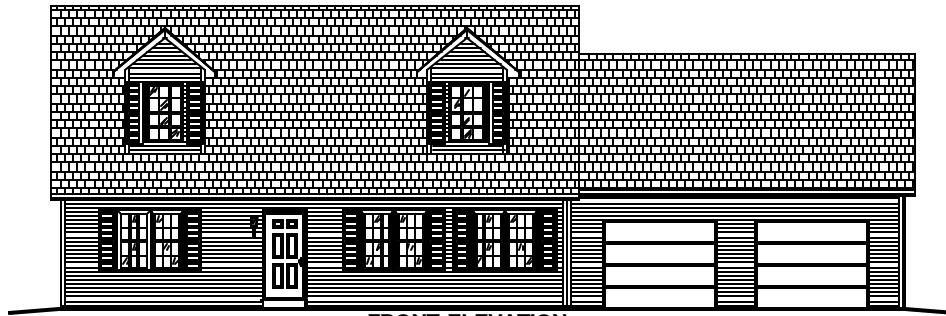
FRONT ELEVATION OVERALL DIMENSIONS: 66'-7" x 28'-0"