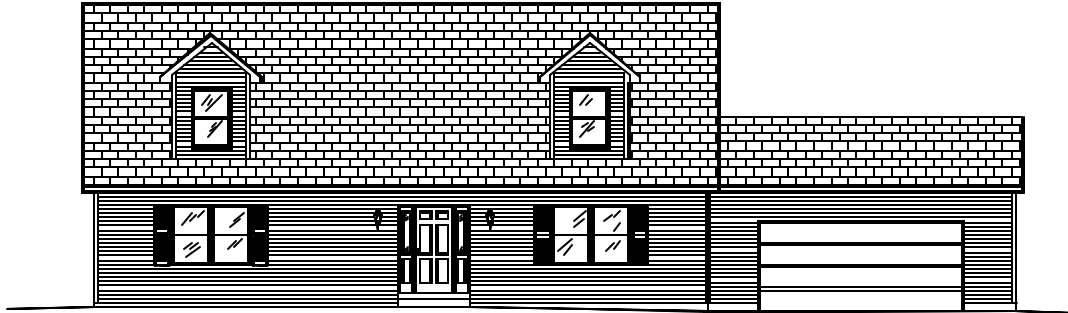
FRONT ELEVATION OVERALL DIMENSIONS: 48'-0" x 28'-0"